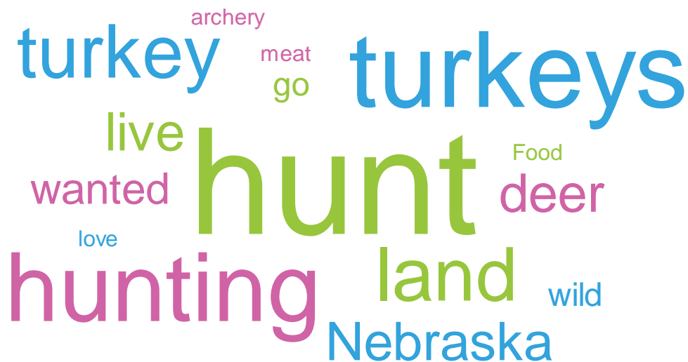
Figure 3. Word cloud of significant terms from the free responses received for “Other,” about why hunters chose to hunt turkey in Nebraska during the 2018 fall season (Appendix 2 for complete list).