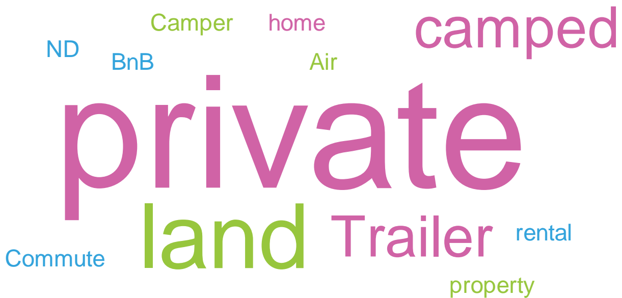
Figure 8. Word cloud for “Other” responses to where respondents stayed while hunting turkey in Nebraska during the 2018 fall season (Appendix 3 for complete list).