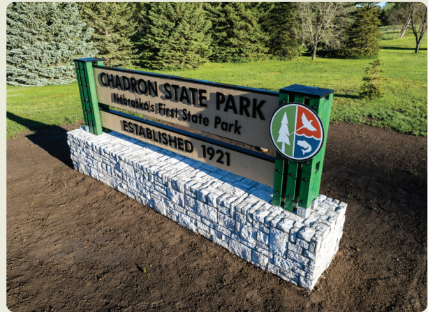
The 101-year-old Chadron State Park in the Pine Ridge of Dawes County got a new entrance sign in 2022 as part of park improvement plans.