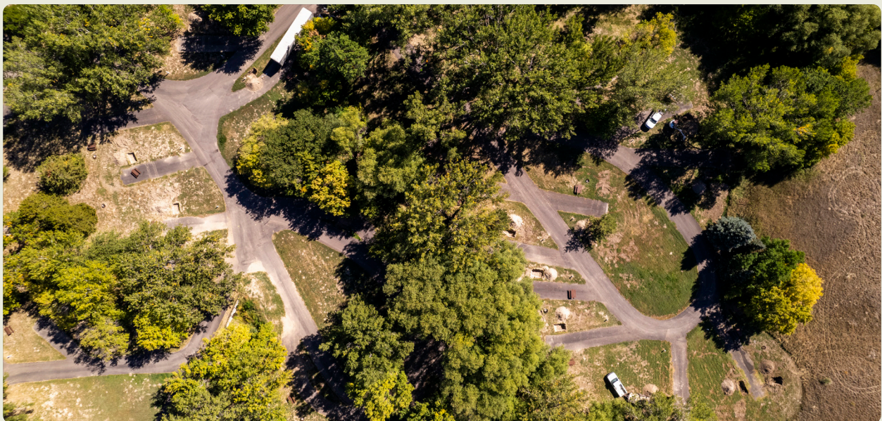
A proposed project will accommodate upgrades to 50-amp service at Solider Creek Campground at Fort Robinson State Park in Dawes and Sioux counties.

Smith Falls State Park boardwalk upgrade construction