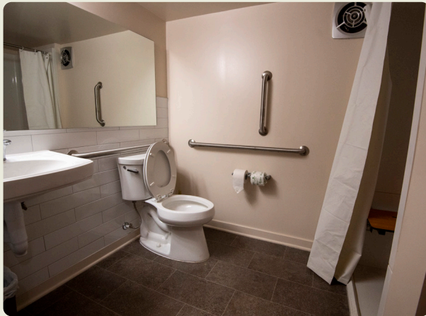
The bathroom of one of 10 caboose cabins at Two Rivers State Recreation Area in Douglas County has been made wheelchair accessible.

Lake McConaughy State Recreation Area way-finding signage design