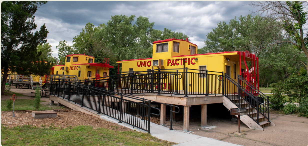
Ten cabooses that once served Union Pacific Railroad are furnished as cabins at Two Rivers State Recreation Area in Douglas County. Improvements completed in 2022 through the Capital Maintenance Fund include making one of the cabooses American with Disabilities Act compliant; it now has a wheelchair ramp, a wider door and renovated bathroom (see photo next page). All cabooses also got a fresh coat of paint.