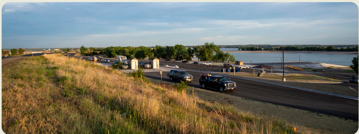
A new entrance to Martin Bay at Lake McConaughy State Recreation Area in Keith County was completed in May of 2022. The project will improve access and traffic flow at the park's most popular entrance. The project was partially funded by the Nebraska Game and Parks Commission's Capital Maintenance Fund.