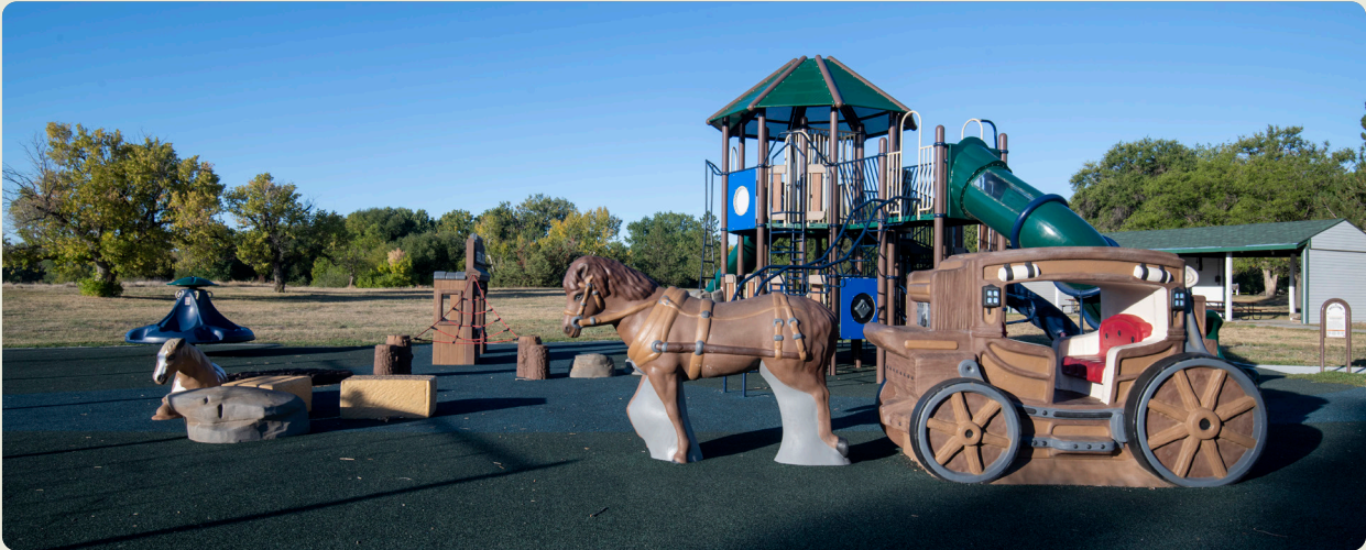
A new themed playground that highlights Nebraska’s pioneering history and other activities to do at Fort Robinson State Park, such as stagecoach rides, was installed at the park in Sioux and Dawes counties.