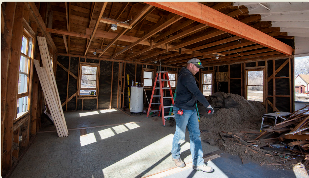
The cabins at Victoria Springs State Recreation Area were renovated to make them wheelchair accessible, increase living space and add new outdoor decks. Work was completed in 2021.

Capital Maintenance Fund dollars are spent on improvements at agency facilities statewide, and accomplishments to date have produced numerous positive comments.