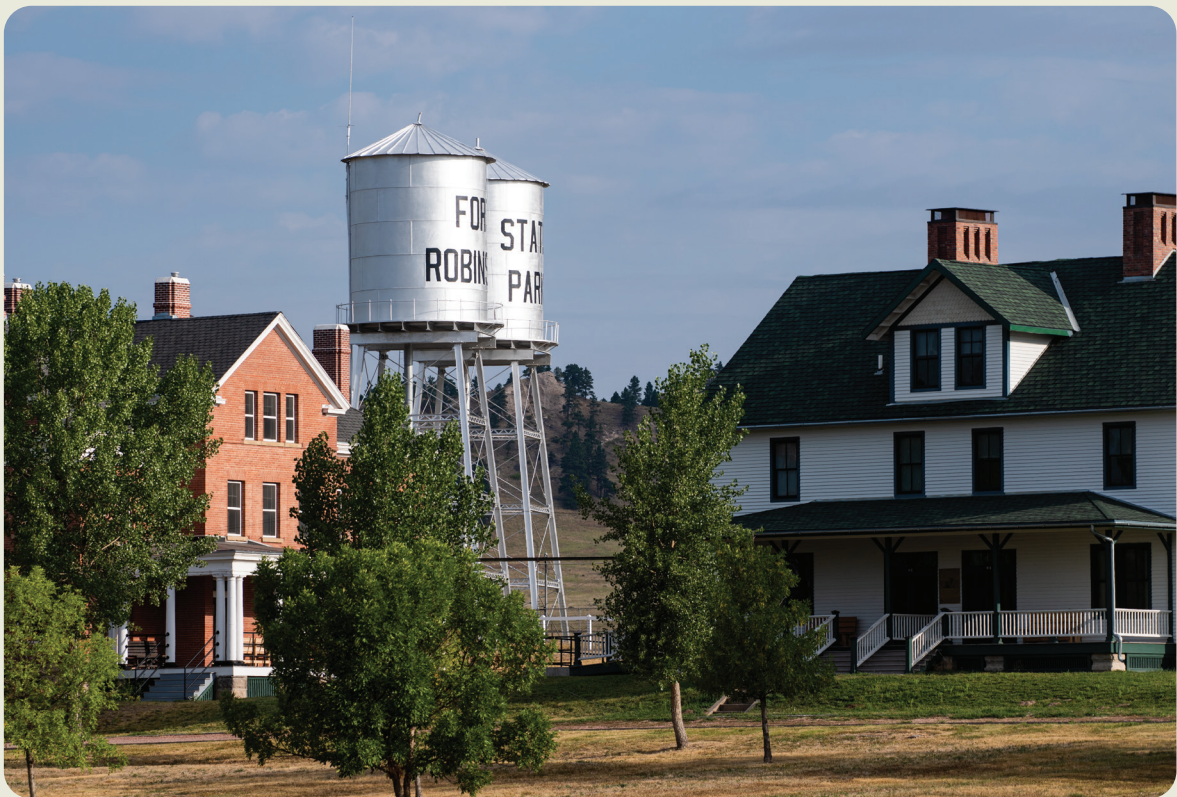
The newly painted water towers gleam in front of the lodging facilities — 1909 Officers Quarters known as “The Bricks” and 1891 Officers Quarters — at Fort Robinson State Park in Dawes and Sioux counties.