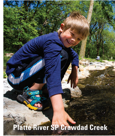
Platte River SP Crawdad Creek

Two Rivers' lakes #1 through #4 are all excellent for bluegill and bass of all sizes. Lake #5 is a dedicated trout fishing lake that requires a special daily tag purchased from the office at the park entrance. This lake is best for trout from April through early June and is wonderful for beginners who want to catch beautiful rainbow trout. Use small hooks with corn or a dough bait and fish on the bottom from any shoreline. The lake has an easily accessible ADA dock and highly maintained and groomed shorelines that are very family friendly.