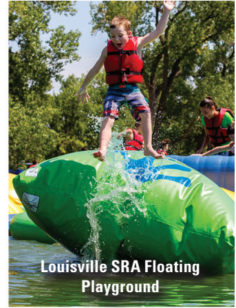
Louisville SRA Floating Playground