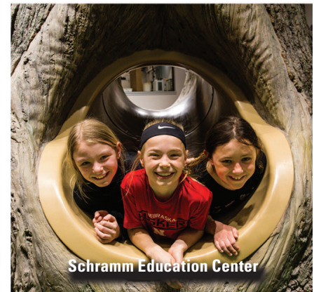
Schramm Education Center