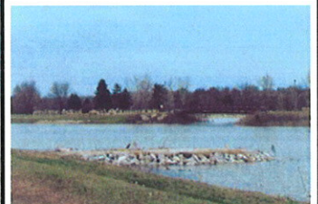
ANGLER SHELF AND FISHING POD CONSTRUCTED AS A COMPONENT OF THE 2006 LAKE RESTORATION.

LOCATED IN BOWLING LAKE PARK NW LINCOLN, LANCASTER COUNTY, NEBRASKA