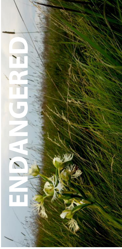
Prairie Fringed Orchid