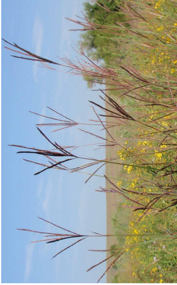
Big Bluestem grass