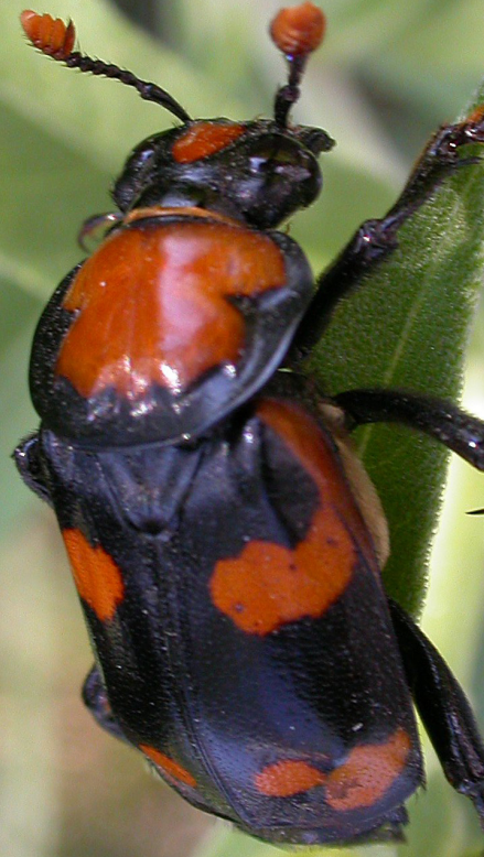
American Burying Beetle