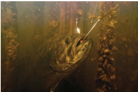
Quality largemouth can be found at multiple Omaha hotspots.

Notes: Halleck is the perfect walk-around lake for folks of all ages. Frequent Nebraska Game and Parks Commission-sponsored family fishing nights are held here due to accessibility and ability to catch fish.