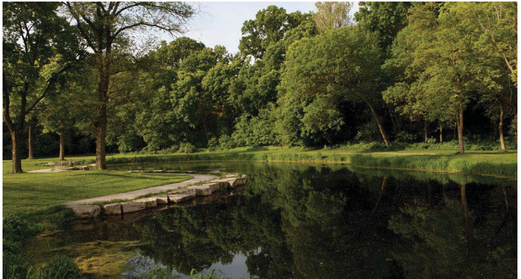
Towl Park near West Center and 93rd streets is a small, scenic lake that offers good panfishing, making this destination a perfect spot to take children.

Notes: This small pond in north Omaha has good water quality and solid panfishing for introducing youngsters.