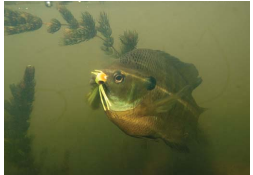
Bluegill (pictured), channel catfish and largemouth bass are species usually stocked throughout Omaha. Some waters will also have crappie and seasonally stocked rainbow trout.

Notes: Excellent water quality and clarity make this a great little pond. Lots of small crappie and catfish are the norm, but some big bluegill can also be found.