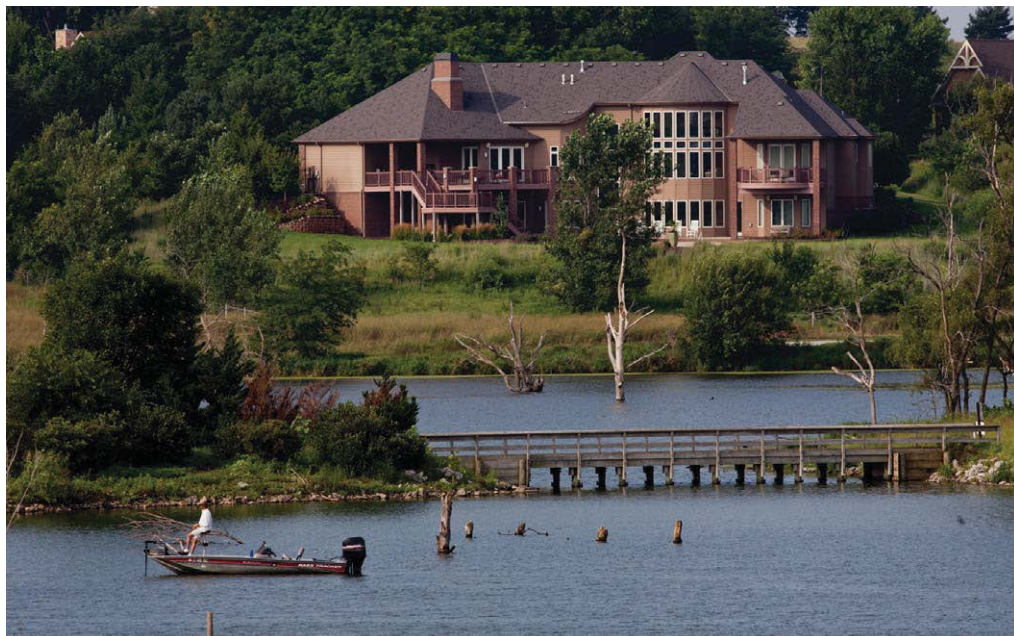
A largemouth bass angler fishes multiple cover options at Walnut Creek Reservoir in Papillion.

Notes: A lake in its prime, it can give up large numbers or large fish. Early mornings and late afternoons can be spent catching bass on scum frogs and other topwaters, as