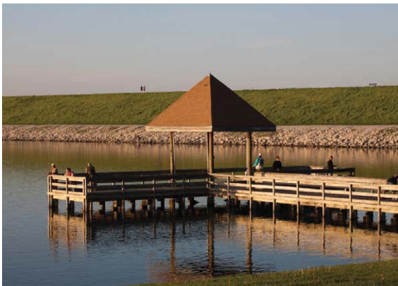
Newly re-opened Zorinsky Lake features a wheelchair-accessible fishing pier.

and nearly all of them are accessible by those willing to walk in the short grass around the lake.