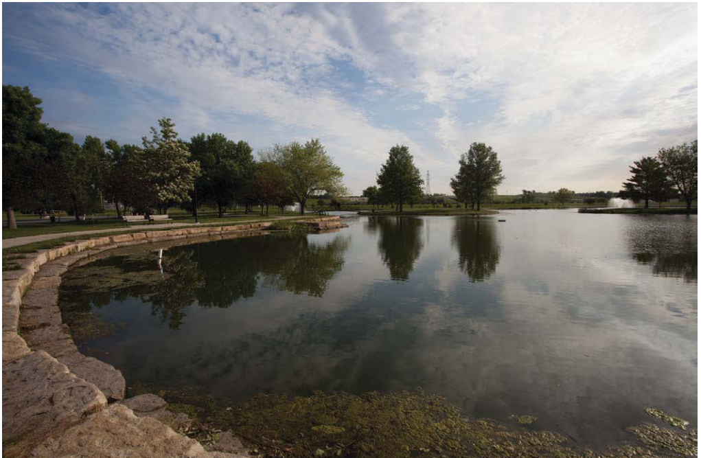
Because of Lake Halleck's abundant shoreline access, the Nebraska Game and Parks Commission frequently uses this lake for its family fishing nights. For more information about this program, visit OutdoorNebraska.org and click on Fishing.

Notes: Schwer has some nice crappie and largemouth bass,