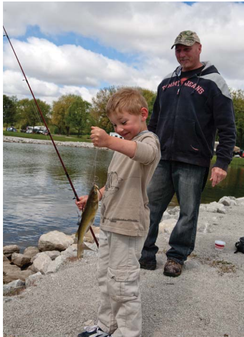
Multiple breakwaters at Glenn Cunningham make this lake a perfect camp-and-fish destination for families in the metro.

Don't shy away from the vegetation during the summer months, however. While more challenging to fish, exploding bass and bluegill populations have made it very worthwhile.