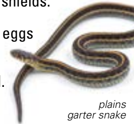
plains garter snake